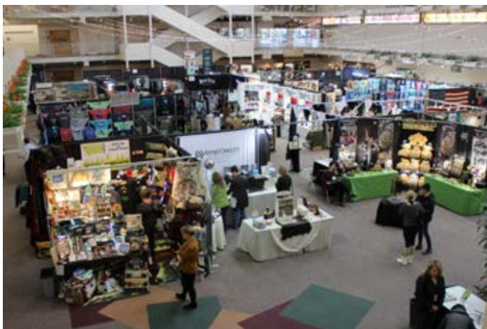
Terrace Gardens in the Mart Building ( February only)