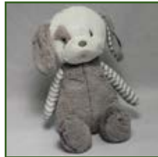
Plush & Toy