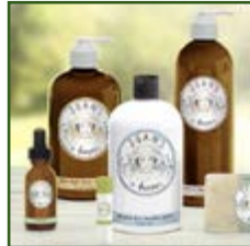
Spa & Wellness