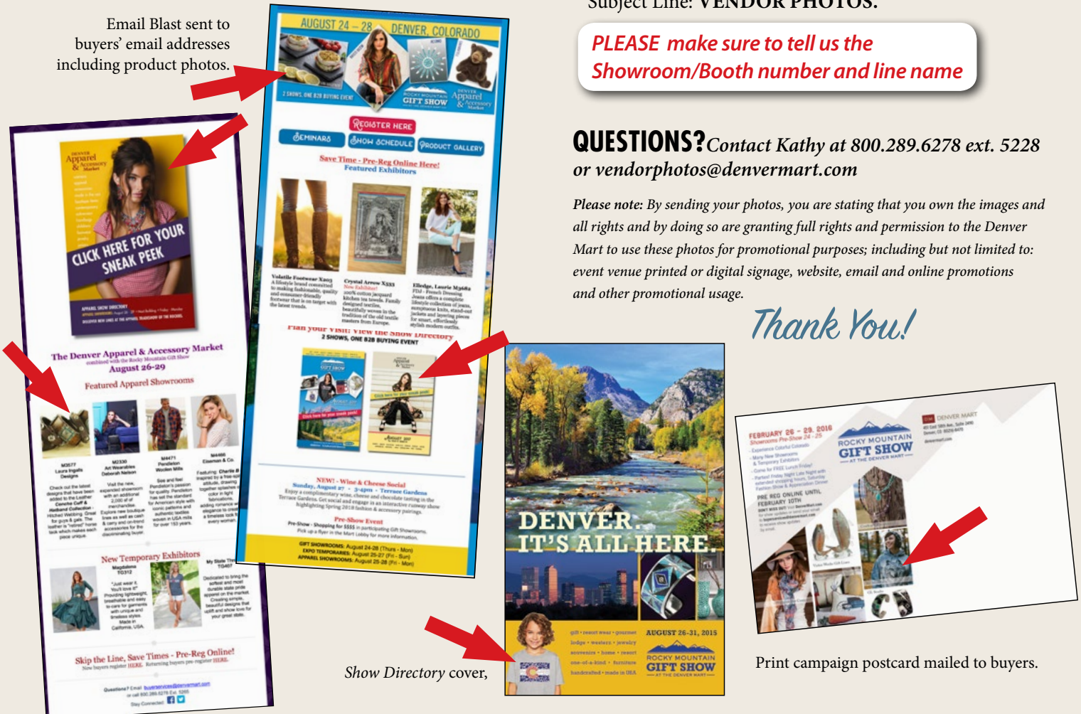
Show Directory cover,